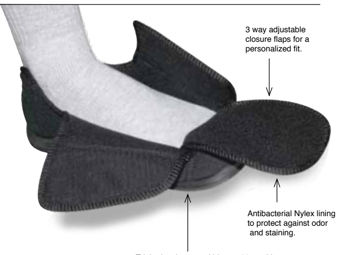
Triple density natural blown 100% rubber soles. Ensures a durable slip resistant tread.

Sizes: 7-12, 13, 14, 15 (medium and ED widths)